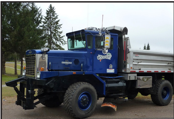
Wisconsin's town governments regularly use BCPL's Local Government Trust Fund Loan Program as a trusted and reliable source of funding for needed capital purchases. The Town of Woodruff in Oneida County financed the purchase of their plow truck and dump box package.

BCPL executives understand and appreciate the long and mutually beneficial ties between their agency and local government. They also understand that town government is going through a period of turnover in local leadership. There are new faces in the crowd who possibly have never heard of the agency or its mission. In an effort of ongoing education, BCPL employees make themselves available for meetings where town officials are in attendance. WTA Unit chairs should consider putting BCPL on the agenda. The BCPL website will be especially helpful for local