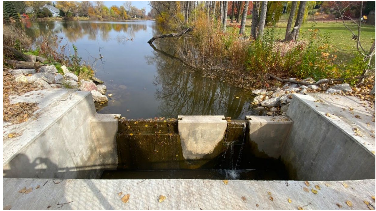
Palisades Pond Lake District dam