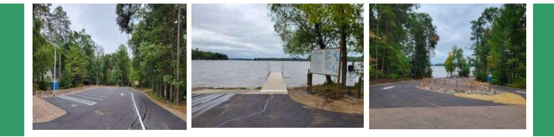
Post Lakes Protection & Rehab District public boat landing