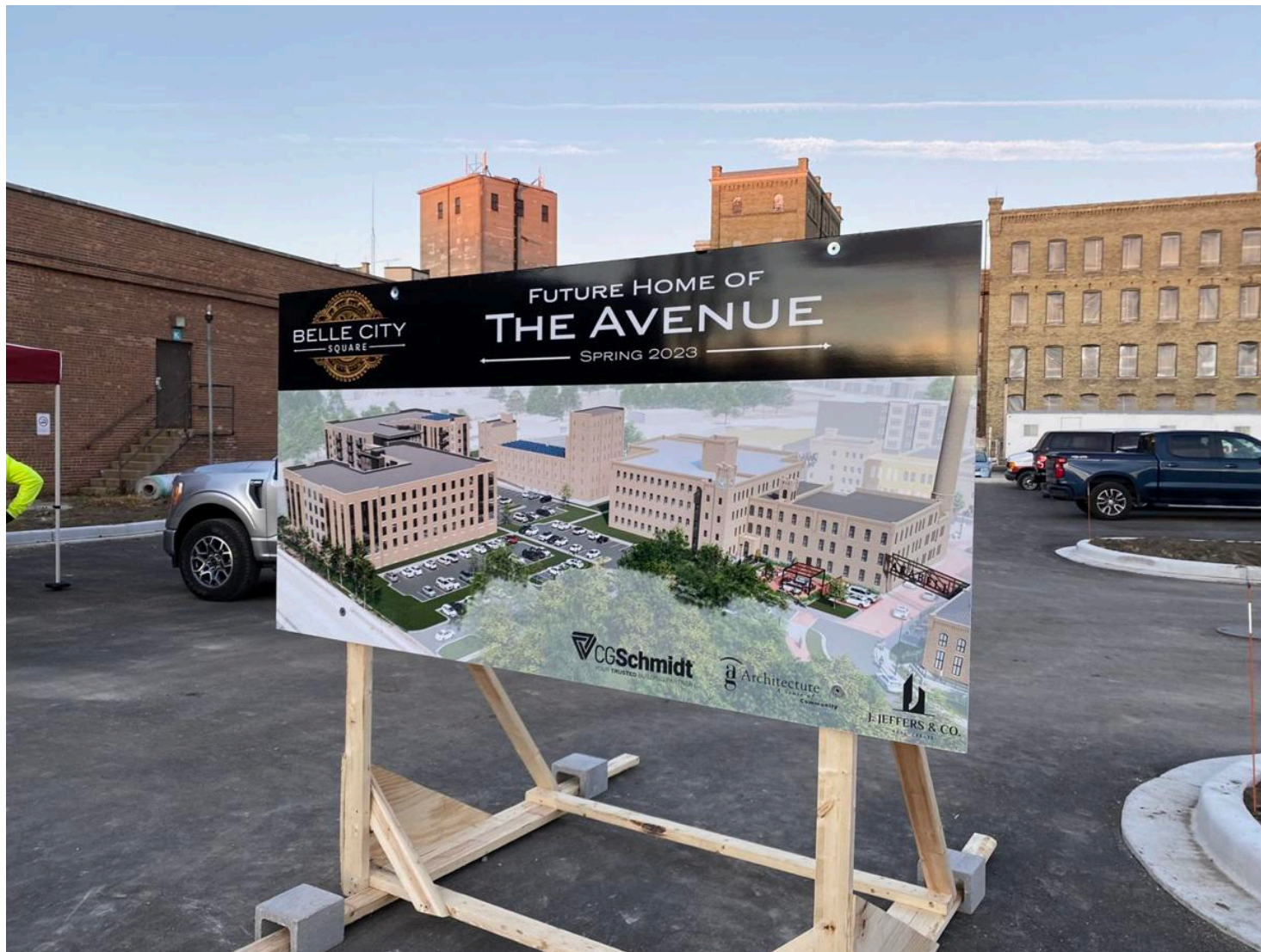
A sign denoting a rendering of how part of the Belle City Square apartment campus will look when it's complete sits in the parking lot Thursday during the ground breaking ceremony of The Avenue buildings.