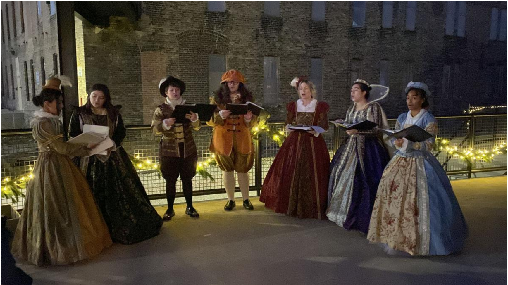
Horlick Madrigal singers perform Christmas carols at the tree lighting Thursday at the Belle City Square apartment campus.